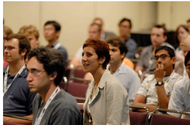
There were about 100 participants from many different countries taking part in the Symposium