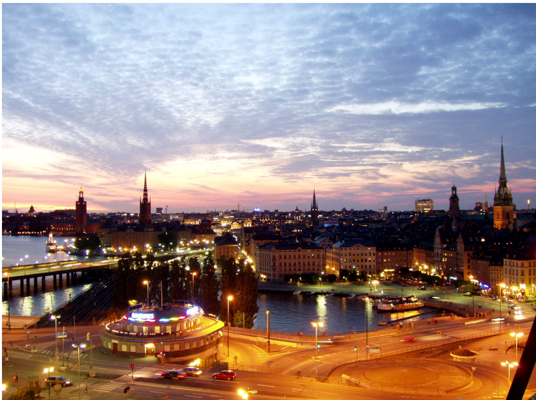
The Student Council Symposium 2009 will take place in enchanting Stockholm